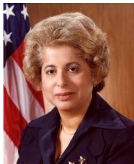
Patricia Roberts Harris Secretary of Housing and Urban Development 1977 (Carter)