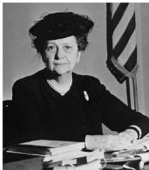
Frances Perkins Secretary of Labor 1933 (Roosevelt)