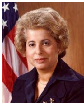
Patricia Roberts Harris Secretary of Housing and Urban Development 1977 (Carter)