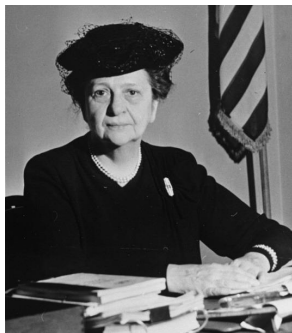
Frances Perkins Secretary of Labor 1933 (Roosevelt)