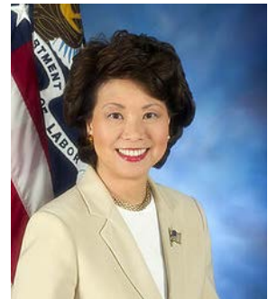
Elaine Chao Secretary of Labor 2001 (G.W. Bush)