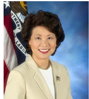
Elaine Chao Secretary of Labor 2001 (G.W. Bush)