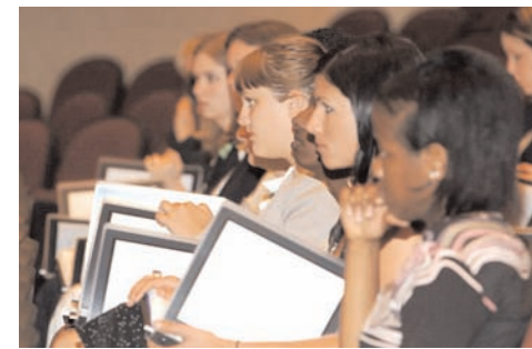
Participants in Auburn's 2006 Women's Leadership Institute listen to speakers after receiving their program notebooks on the first day.