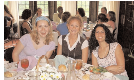
NEW Leadership Pennsylvania students at the 2007 keynote dinner