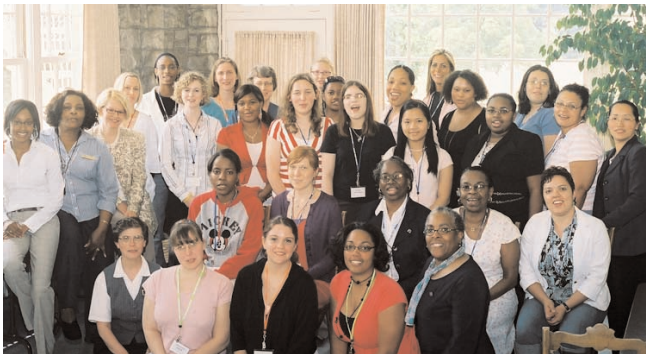
Mount Mary College 2007 NEW Leadership Wisconsin Class.

The NEW Leadership™ Development Network now includes sixteen programs around the country modeled on NEW Leadership New Jersey. The newest additions are in two states highly visible in the presidential nomination process – Iowa and New Hampshire. Both the University of Iowa and St. Anselm College will host their first programs in 2008. On this page are photos from some partner institutions with established programs for college students based on the CAWP model.