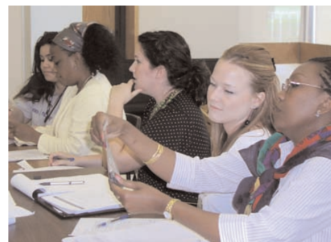
Students acting as a legislative committee for the NEW Leadership action project examined an exhibit submitted by students testifying about school bus emissions.

I felt that the organizers did a wonderful job in imparting so much knowledge and cultivating so many useful skills in the participants. I myself felt that I gained many skills in the process of this program that will be useful to me no matter what field I decide to enter. I also gained a lot of confidence from this experience, as I am sure did many of my peers, and I came to believe that I could, one day, sit on a panel of other distinguished women, imparting my knowledge to a new generation of female leaders. I felt that through this program I was able to expand my own vision for myself in the future. I am truly grateful for this experience and I intend to keep in touch with my fellow participants, and I know that together we can change the world for the better.