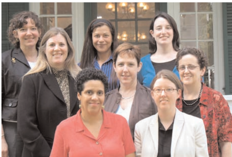
NEW Leadership™ Development Network partners from the University of Iowa, St. Anselm College, and Auburn University join CAWP staff at NEW Leadership New Jersey.