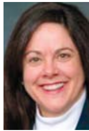
REPRESENTATIVE ROSIE BERGER WYOMING

ages and backgrounds in the legislative process.”